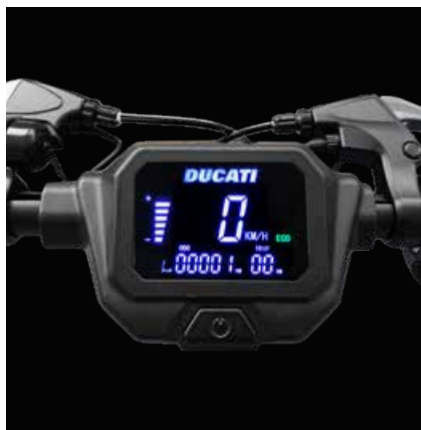
Wide display LCD 3.5"