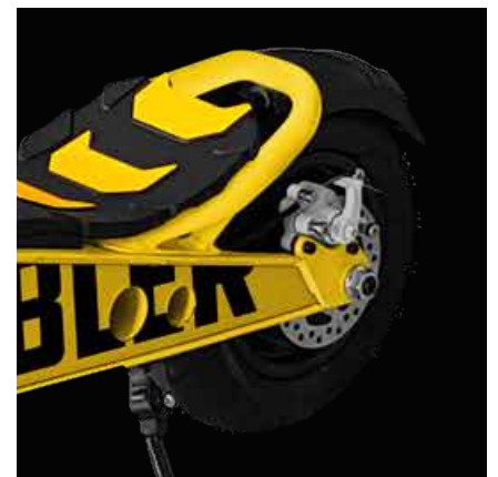
Tubeless tires 110/50-6.5"