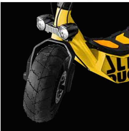
Double front LED light